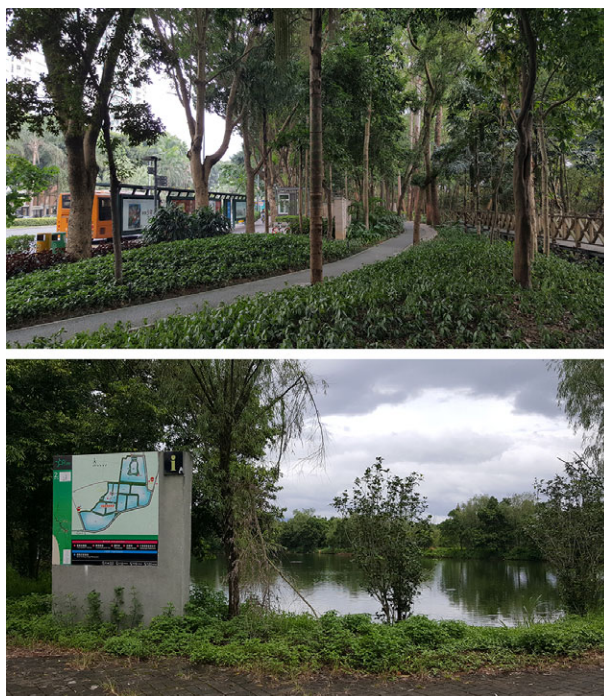
Figure 2: Examples of greenways in the PRD—an urban greenway in Shenzhen converted from a greenbelt (top) and a rural greenway in Guangzhou running along fishponds (bottom). [Colour figure can be viewed at wileyonlinelibrary.com ]

rural areas legally requires the green light of rural village collectives owning the land parcels concerned, and practically the consent of villagers currently using them. That being said, the PRDGP was put forward with much optimism. As a member of the planning team suggested, the PRDGP is feasible because greenways bear economic potential linked to recreational development: